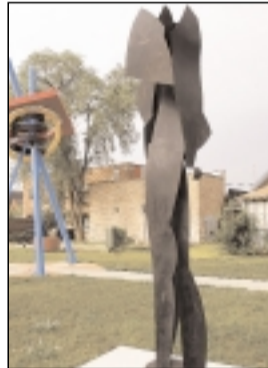
16 — "Centurion"