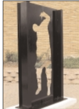
22 — "Strum"