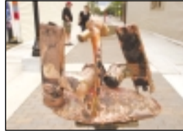
4 — "110"