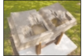
12 — "Homage"