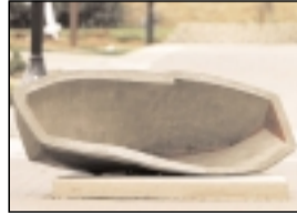
3 — "Nondiscursive Impression"