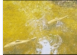
10 — "Three Fish"