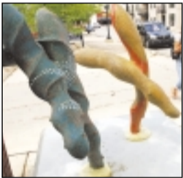
26 — "Dual"