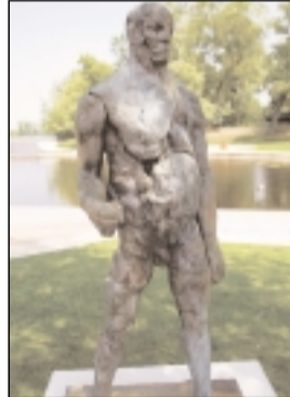
13 — "Decision Pending"