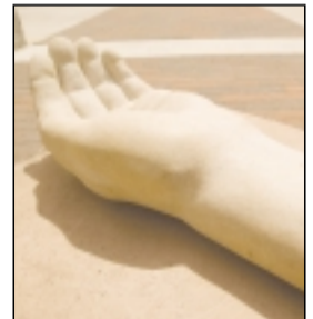
2 — "Hand"