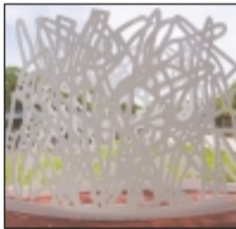
8 — "Lineage"