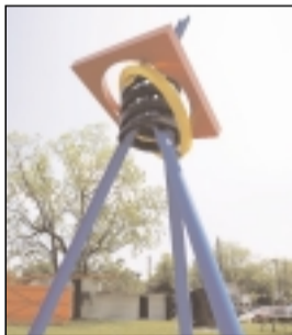
17 — "Evolution One"