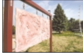
6 — "The Arts"