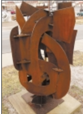
25 — "Logic"