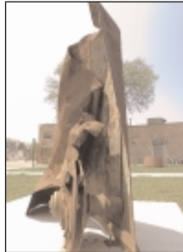
19 — "American Beauty"