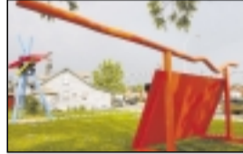
18 — "Landscape Sunset"