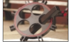
14 — "Don Quixote"