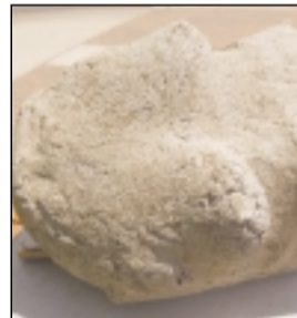
20 — "Hybrid"