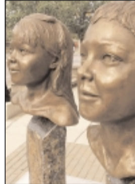
21 — "The Children"