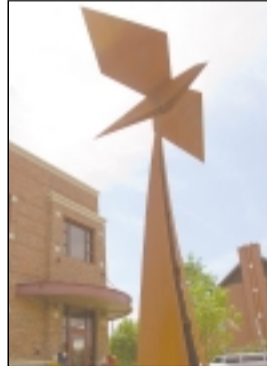
28 — "The Bird"