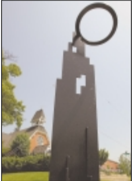
11 — "City With a Halo"