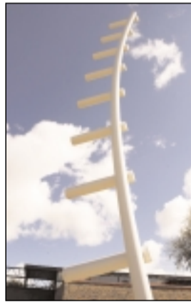
7 — "Standing Arch"