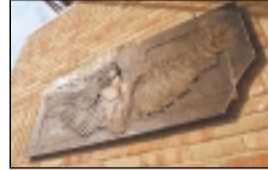
5 — "Freedom"