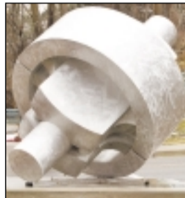
24 — "Winter 05"