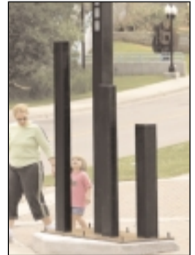
23 — "Steel"