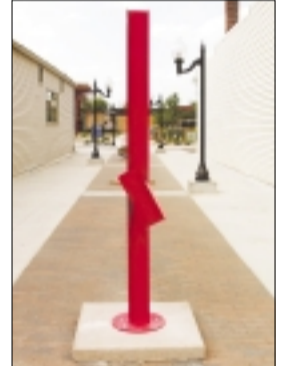
1 — "Pieta"